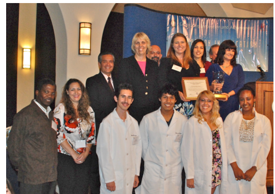
Impact Award Winners, San Ysidro High School "Medical Pathways"

Sweetwater Union High School District received the inspire Award for creating a learning program that includes sports-like competition by student teams in developing robots to overcome functionality obstacles. The program emphasizes